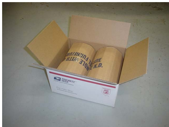
figure 4 – pack ends with paper and place into box