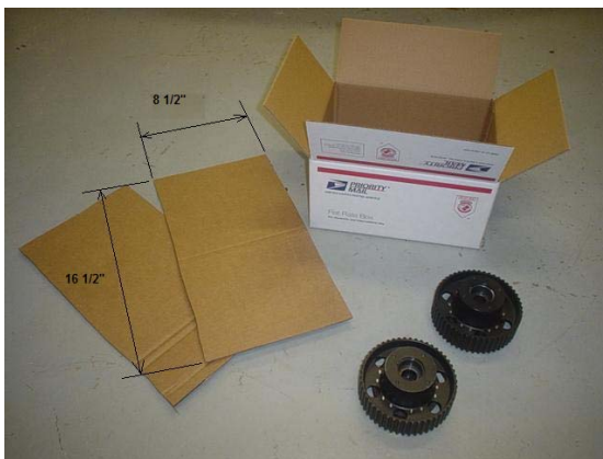
figure 1 – two strips of cardboard 8½" wide x 16½" long

Please fill out and include a Core Credit Refund sheet, which you can download at: http://bde-performance.com/cores.htm